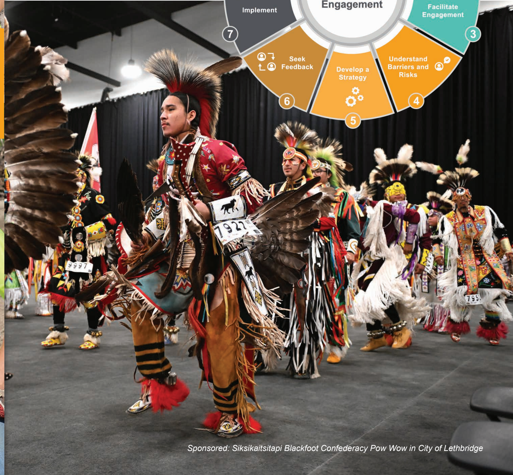
Sponsored: Siksikaitsitapi Blackfoot Confederacy Pow Wow in City of Lethbridge